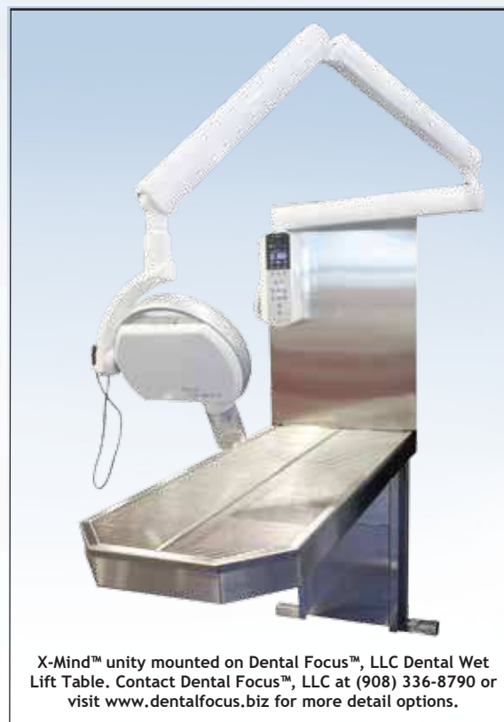
X-Mind™ unity mounted on Dental Focus™, LLC Dental Wet Lift Table. Contact Dental Focus™, LLC at (908) 336-8790 or visit www.dentalfocus.biz for more detail options.