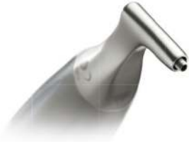
AIR-N-GO® easy SUPRA 120° 2 nozzles supplied as standard