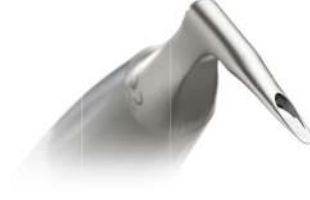
AIR-N-GO® PERIO easy Nozzle supplied with the PERIO kit (optional)