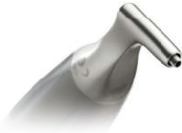
AIR-N-GO® easy SUPRA 120° 2 nozzles supplied as standard