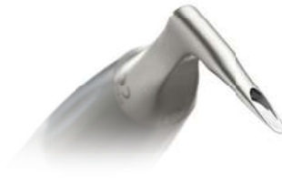
AIR-N-GO® PERIO easy Nozzle supplied with the PERIO kit (optional)