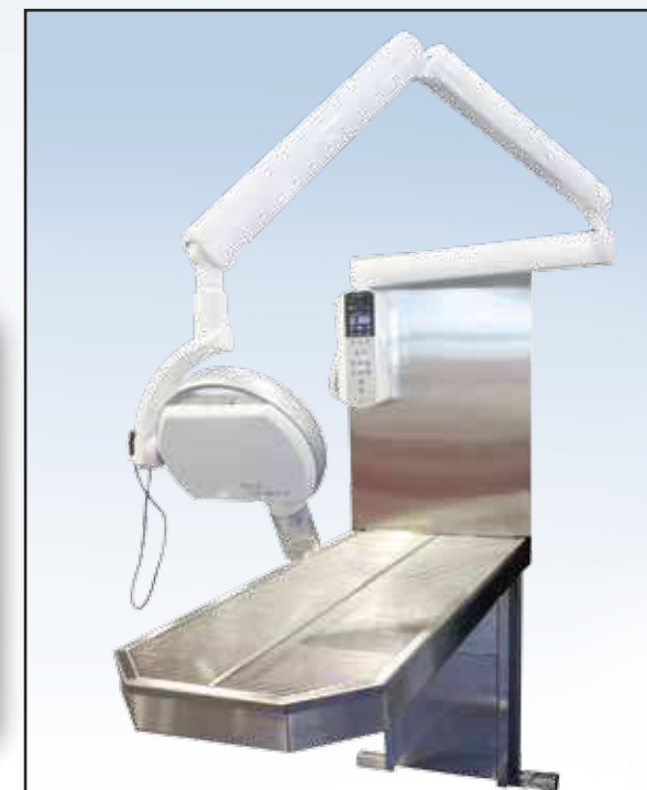
X-Mind™ unity mounted on Dental Focus™, LLC Dental Wet Lift Table. Contact Dental Focus™, LLC at (908) 336-8790 or visit www.dentalfocus.biz for more detail options.